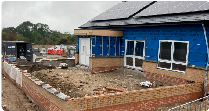
SIPs installation during the construction phase of the Early Years extension

With the use of SIPs (structural insulated panels) and method methods of construction, reducing waste through manufacturing offsite, along with recycling and sorting of waste products, 95% of waste created was diverted from landfill for the Ysgol Brynffordd project.